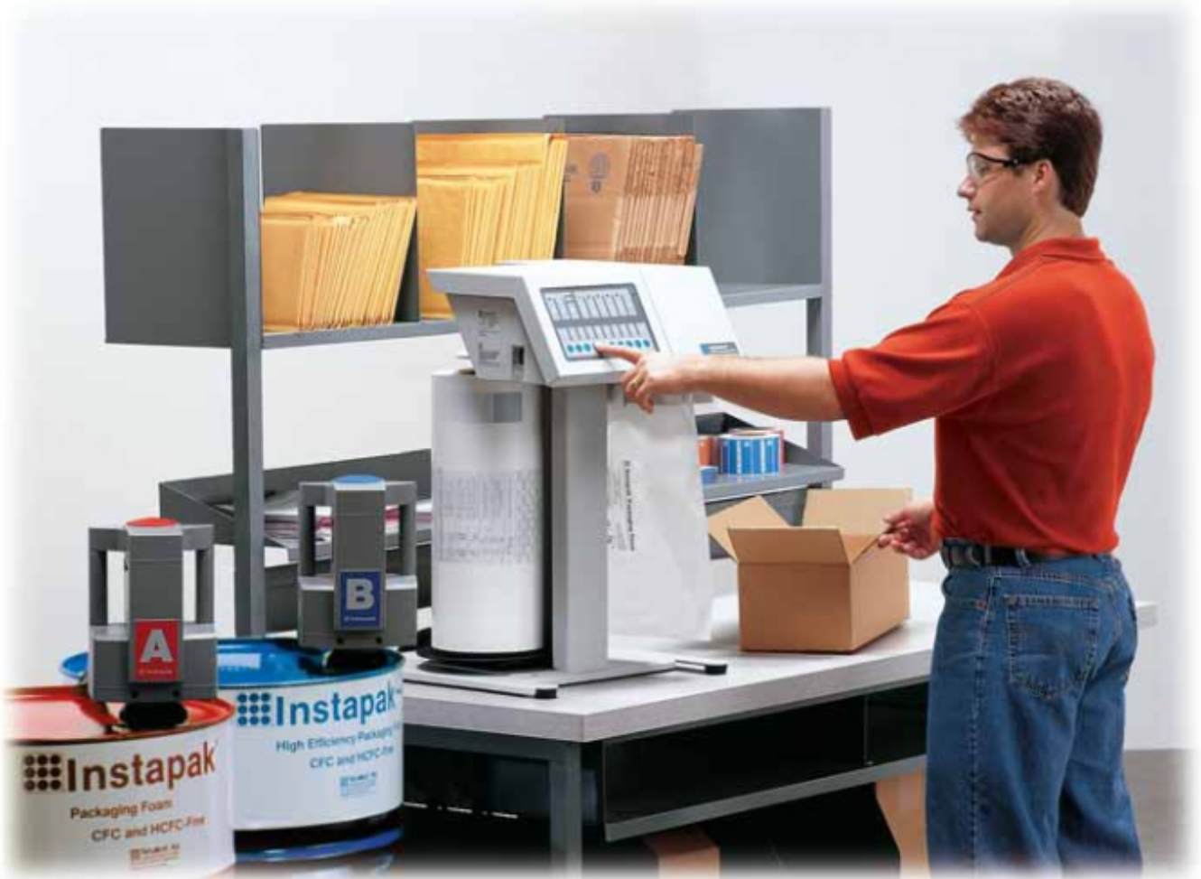
Workbench, Instapak® chemical drums and film not included.